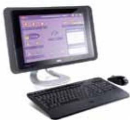
Touchscreen PC configuration