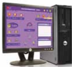
Desktop PC configuration

Call our sales line for a quote on the following: